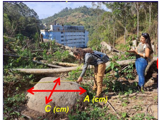
Picture 2. Field method for measuring the axes of the rock blocks at Duas pedras basin in Nova Friburgo.

Taking into account the technical aspects of the Technical Cooperation Agreement, the studies on debris flows are based on the Sabo Manual. Topographic maps at the 1:10,000 scale have been prepared for the Príncipe basin (Teresópolis) and the Duas Pedras basin at the São Lucas Hospital (Nova Friburgo), associated of satellite images to define land use and vegetation cover. The grain size for each basin was determined by geometry and dimensions of the rock blocks. In the case of Teresópolis, a total of 312 blocks were measured due to the greater availability of rock blocks, while in Nova Friburgo, the number was limited to the minimum recommended in the Japanese method, which was 200 blocks, given the smaller amount of rocks to be measured. The activity was carried out using a manual tape measure, where the major and minor axes of each block were measured.