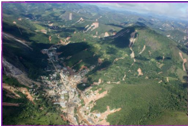
Picture 1. Landslides and debris flows after the heavy rainfalls in Nova Friburgo, 2011 (Dantas river basin).

Since the severe disasters caused by mass movements in January 2011 in the Mountain Region of the State of Rio de Janeiro, the Federal Government of Brazil has been making investments in strengthening the capacity for prevention and response to natural disasters. In order to solve these problems by engineering projects and Sabo dams, two municipalities were chosen to be worked: Nova Friburgo and Teresópolis.